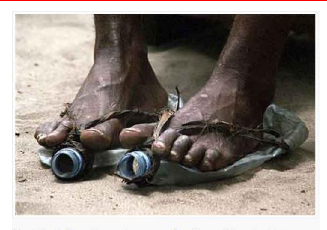
Plastic bottle shoes. Yet another way to simplify your life and make it green.